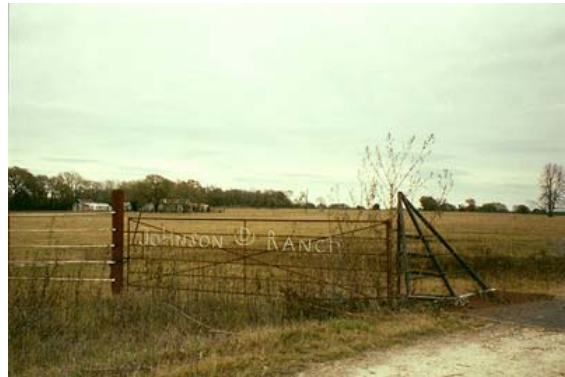
Johnson Ranch, Kosse, Limestone County TX